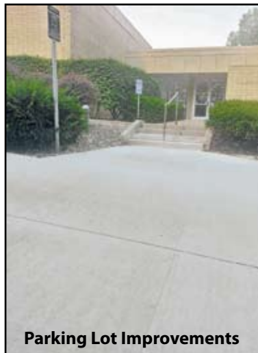
Parking Lot Improvements