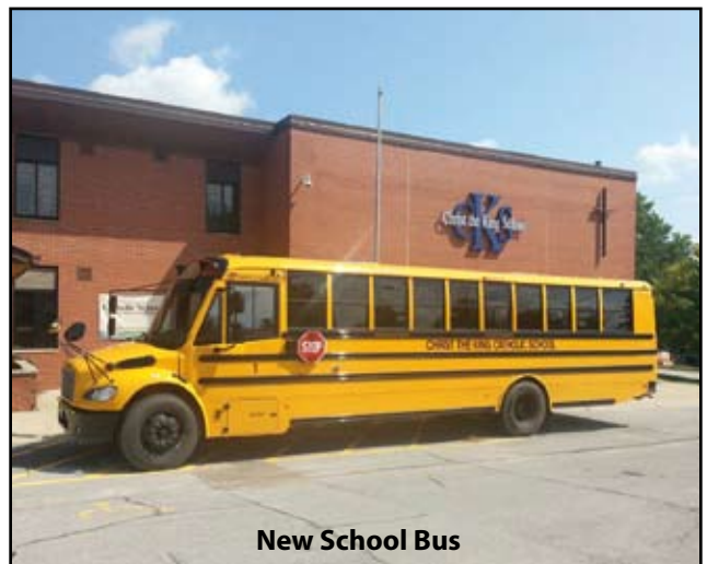
New School Bus